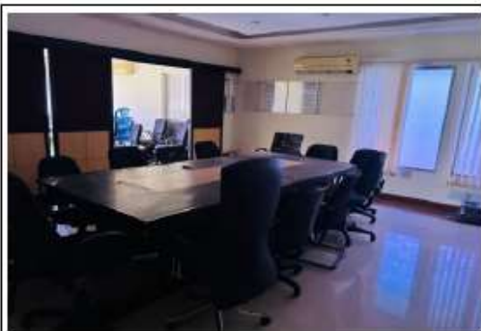
CONFERENCE HALL VIEW