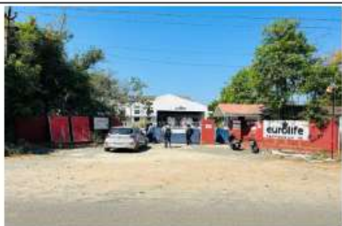
FRONT ELEVATION VIEW