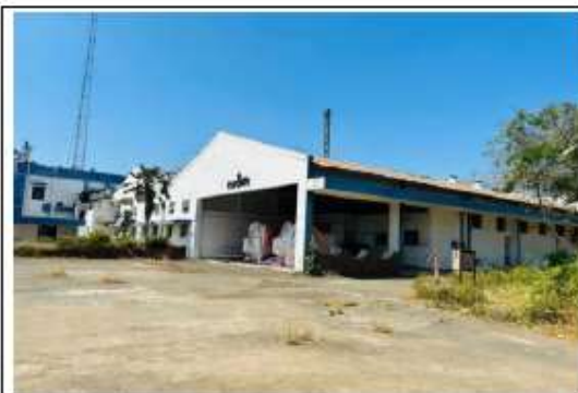
GI SHEET PROCESSING AREA VIEW