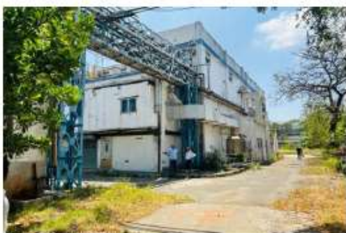
MAIN BUILDING VIEW