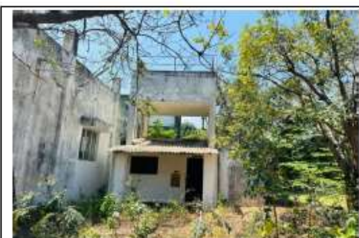
OHT AREA VIEW