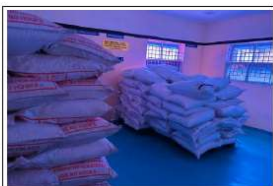
RAW MATERIAL STORAGE AREA VIEW