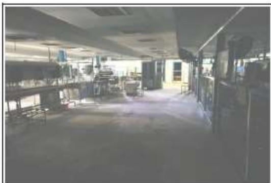
PROCESSING UNIT VIEW