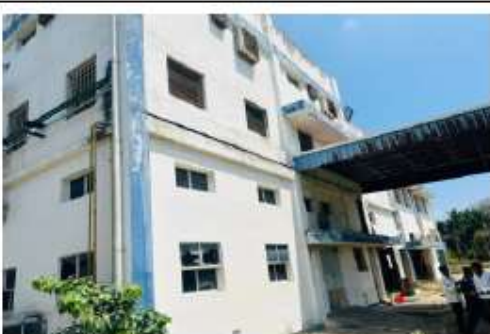
MAIN BUILDING ENTRANCE VIEW