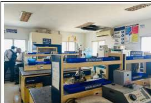
TESTING CUM LABORATORY AREA VIEW