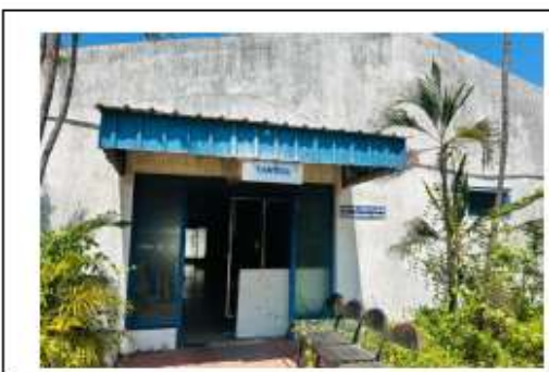
CANTEEN BUILDING EXTERNAL VIEW