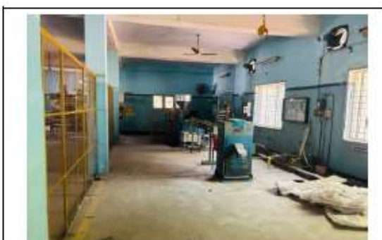
WORKSHOP AREA VIEW