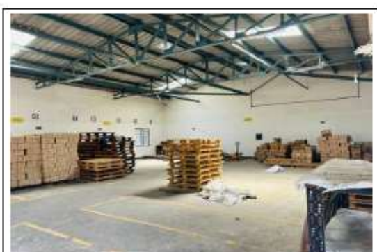
STORAGE AREA VIEW