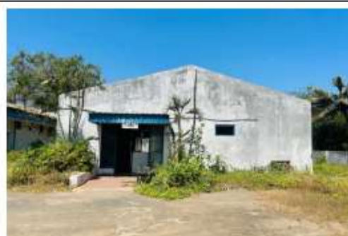
TRUSS ROOF BUILDING EXTERNAL VIEW