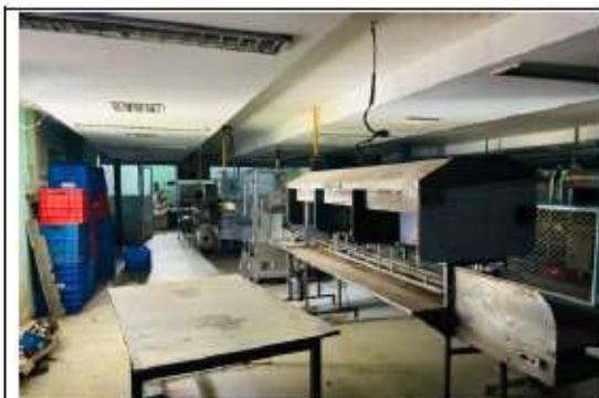
PROCESSING UNIT VIEW 2