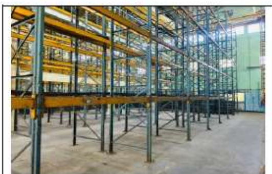
STORAGE GODOWN VIEW