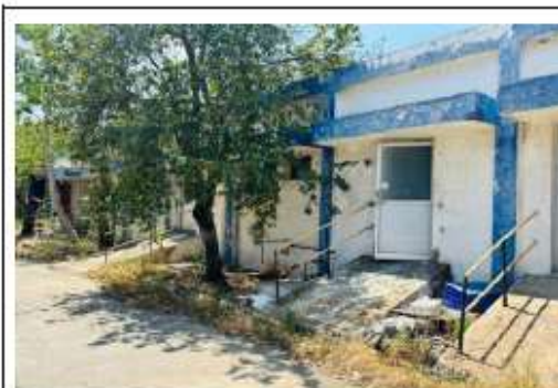
LABOURS SHED AREA VIEW