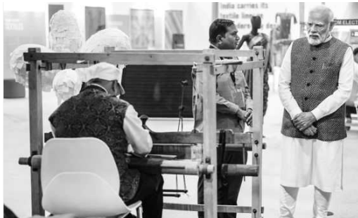
Prime Minister Narendra Modi on Monday promised all support to the textile sector, stressing that it would play a crucial role in making India a developed nation by 2047, when India will complete 100 years of Independence. He was addressing a gathering after inaugurating Bharat Tex 2024 in New Delhi

So far, 1,321 stations of 7,000 have been selected by the railways for redevelopment. Many of them are at different stages of construction. Railways Minister Ashwini Vaishnaw credited the progress to the PM Gati Shakti framework, which