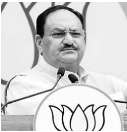
BJP President J.P. Nadda on Tuesday flagged off the party's two dozen vehicles, Viksit Bharat Modi Guarantee Raths, for the Lok Sabha campaigning

Shringla and Sandhu have been tight-lipped about contesting the LS polls but fit the bill for the talented retired bureaucrats that Prime Minister Narendra Modi wants to look after ministerial portfolios. Both Shringla and San-