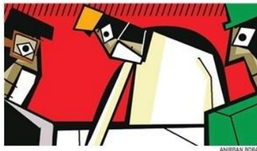
Our Political Bureau

New Delhi: The government has undertaken a top-level security review of the situation along the China border, where tensions have flared up over the past month after PLA troops marched across the Line of Actual Control in the Galwan valley and along the Pangong Tso lake in Ladakh in a breach of border agreements. A comprehensive review of the boundary situation at the senior-most levels involved the top military leadership, diplomats and the National Security Council Secretariat and the ground situation in Ladakh was discussed, as well as ongoing efforts to resolve the crisis through diplomatic channels. Sources said the meeting was preceded by a series of consultations within the Defence Ministry and a detailed analysis was presented to the Prime Minister's Office (PMO). The situation on the border, where Chinese troops have intruded into Indian territory at four separate points, has not changed over the past few days, with