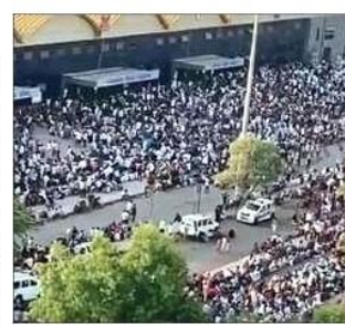
On hearing trains were to operate, thousands gathered at LTT on Tuesday evening, but only few services ran

Mumbai: In what could be an indicator of the progression of Covid-19, BMC chief Iqbal Singh Chahal said the corporation was preparing 1.5 lakh Covid-19 beds till mid-June.